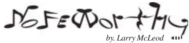
by Larry McLeod

We need volunteers from each Sunday School class, we will be cleaning all Sunday School rooms from top to bottom.